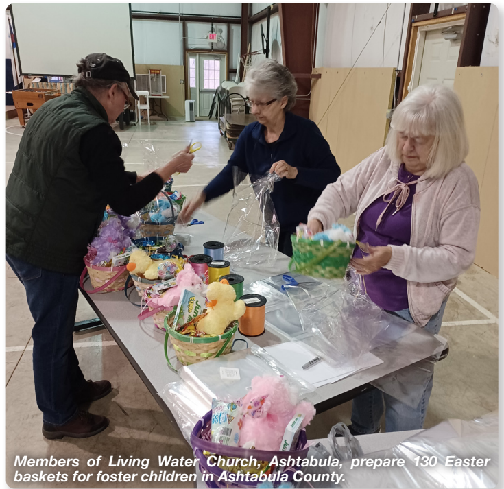
Members of Living Water Church, Ashtabula, prepare 130 Easter baskets for foster children in Ashtabula County.