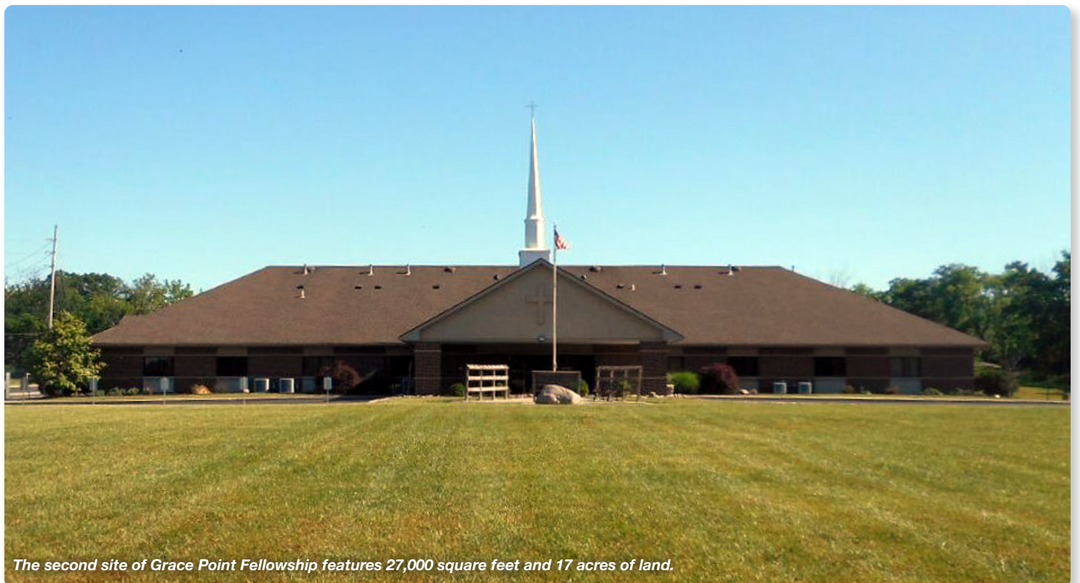
The second site of Grace Point Fellowship features 27,000 square feet and 17 acres of land.