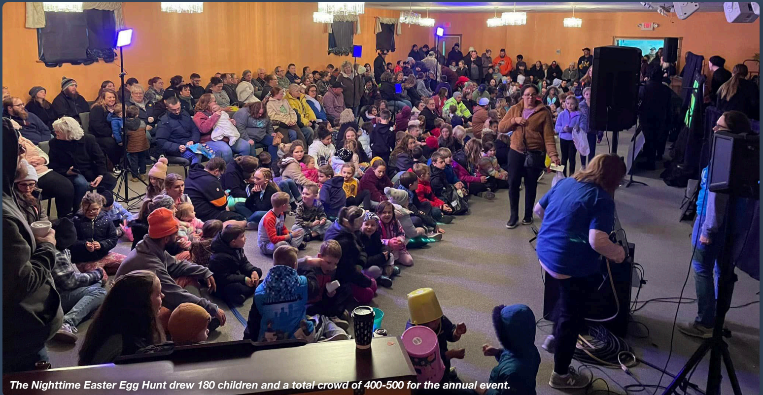
The Nighttime Easter Egg Hunt drew 180 children and a total crowd of 400-500 for the annual event.