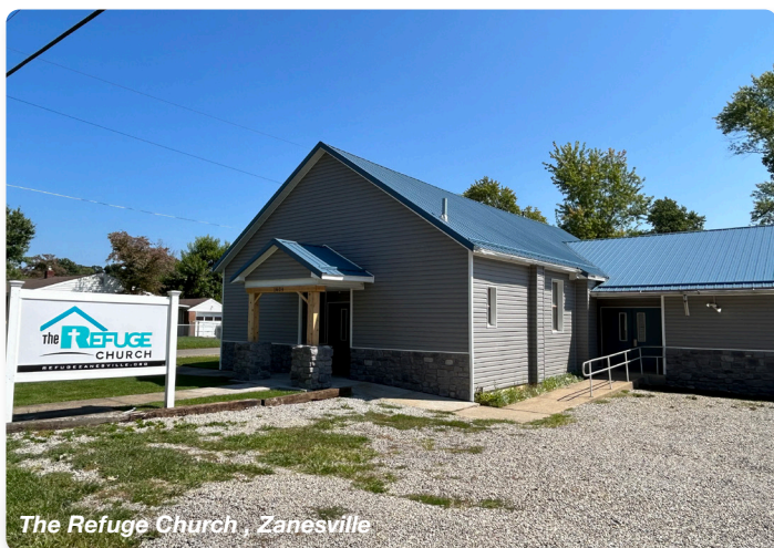
The Refuge Church - Zanesville