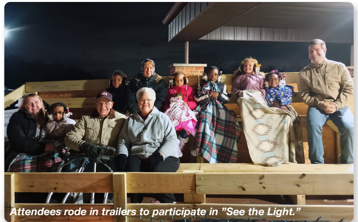
Attendees rode in trailers to participate in “See the Light.”