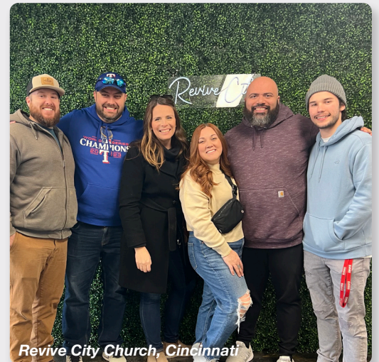
Revive City Church, Cincinnati