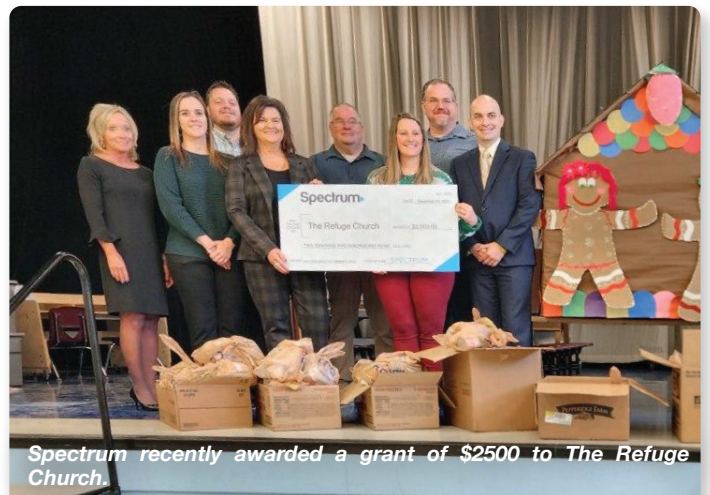
Spectrum recently awarded a grant of $2500 to The Refuge Church.

Looker told the church that he had four non-negotiable changes that had to occur if he were to stay. First, the church must change its name. Second, the leadership of the church would become elder-led instead of deacon run.