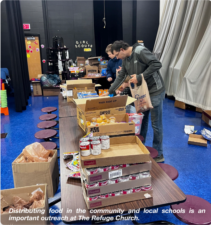
Distributing food in the community and local schools is an important outreach at The Refuge Church.

church has provided hats, gloves, and clothing as well as “Blessing Bags,” which contain meals for the weekend.