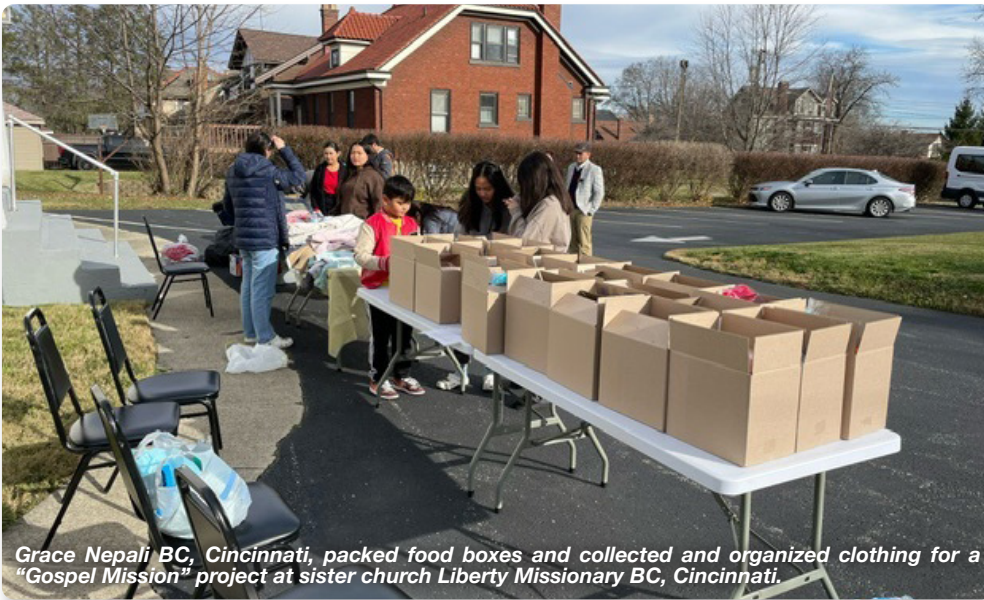
Grace Nepali BC, Cincinnati, packed food boxes and collected and organized clothing for a "Gospel Mission" project at sister church Liberty Missionary BC, Cincinnati.

Two Cincinnati-area churches recently partnered to impact a local community in a tangible way.