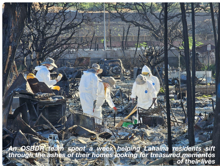
An OSBDR team spent a week helping Lahaina residents sift through the ashes of their homes looking for treasured mementos of their lives