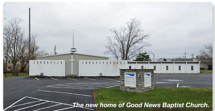
The new home of Good News Baptist Church.

We are truly excited about what the Lord has done and is continuing to do! Our hope is to be in our new location by Christmas or shortly thereafter. God is so good! He provides and makes a way when there seems to be no way! I want to encourage anyone reading this to know it is certainly true that WITH GOD, ALL THINGS ARE POSSIBLE! “