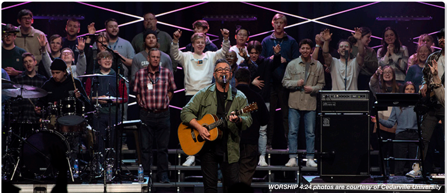
WORSHIP 4:24 photos are courtesy of Cedarville University