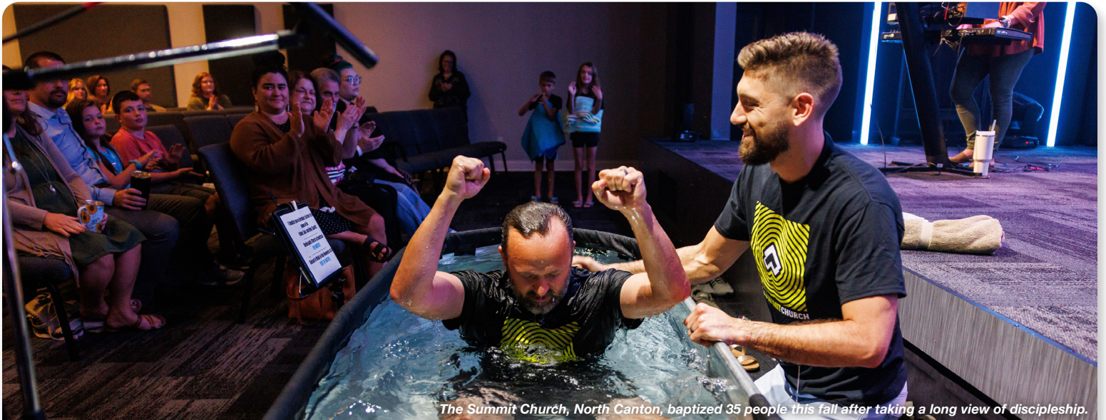
The Summit Church, North Canton, baptized 35 people this fall after taking a long view of discipleship.