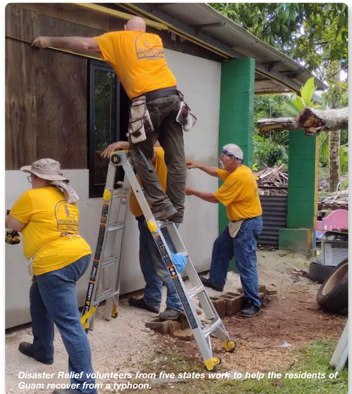
Disaster Relief volunteers from five states work to help the residents of Guam recover from a typhoon.