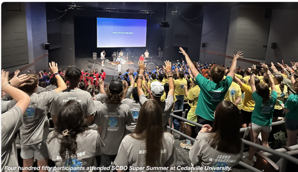
Four hundred fifty participants attended SCBO Super Summer at Cedarville University.

The Noah Ayers Band led students and leaders together in worship each evening. The band members are currently enrolled Cedarville students or recent graduates who are now leading worship in local churches in and around Cedarville.