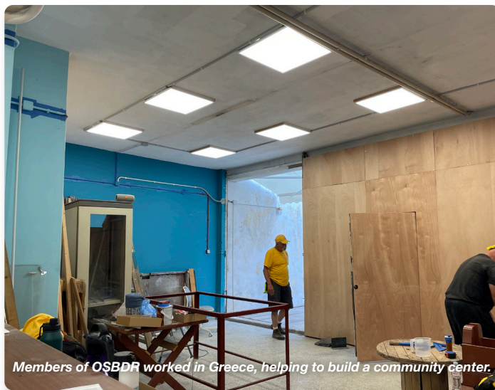
Members of OSBDR worked in Greece, helping to build a community center.

During their ten days on the ground in Athens, the team members were able to complete more work than expected. However, one need was still unmet. The issue was how to provide heating and air conditioning so the community center could operate year-round.