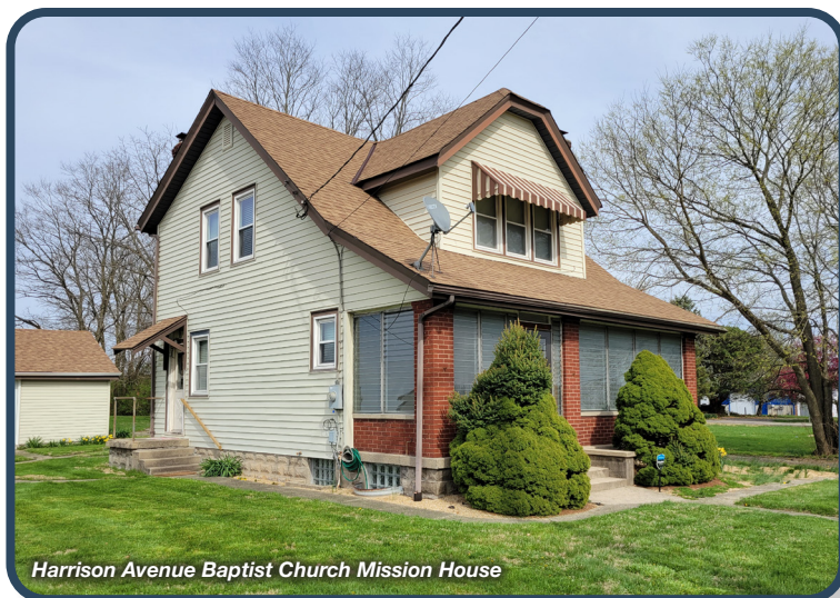
Harrison Avenue Baptist Church Mission House