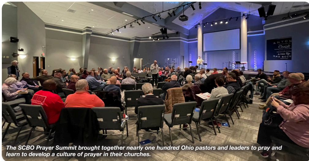
The SCBO Prayer Summit brought together nearly one hundred Ohio pastors and leaders to pray and learn to develop a culture of prayer in their churches.